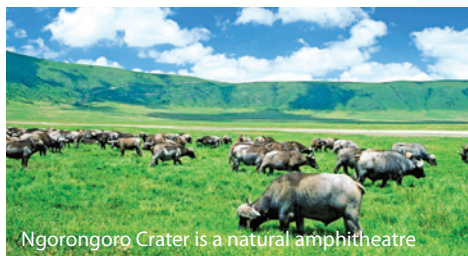
Ngorongoro Crater is a natural amphitheatre

Enjoy a full day, with morning and evening games drives, in the Serengeti National Park. (BLD)