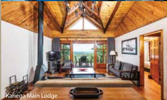
Kariega Main Lodge