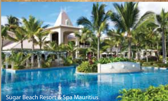
Sugar Beach Resort & Spa Mauritius