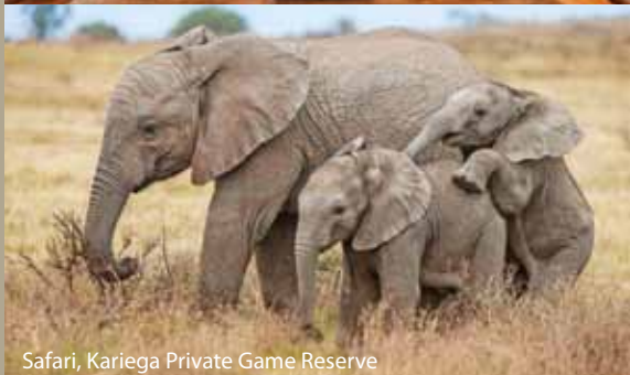
Safari, Kariega Private Game Reserve