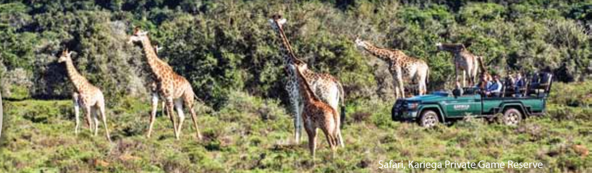
Safari, Kariega Private Game Reserve